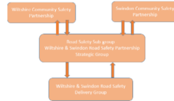
Wiltshire & Swindon Road Safety Partnership Governance

We will work towards achieving the following objectives: